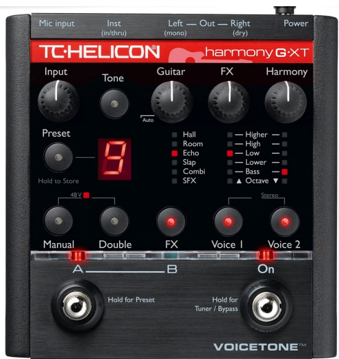
Harmony GXT Front: