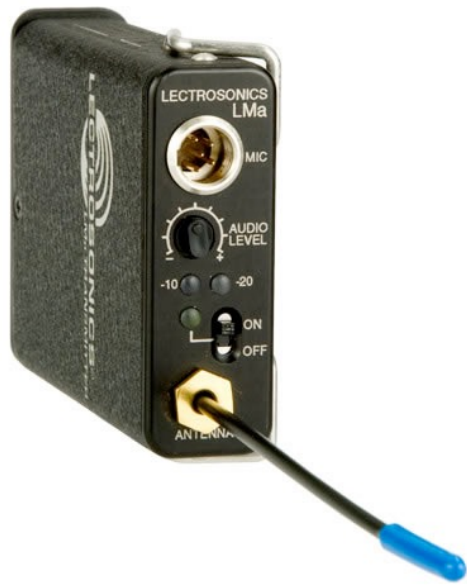
Lectrosonic LMa Transmitter: