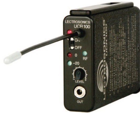
Lectrosonic UCR100 Receiver: